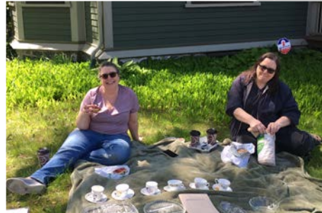
Neighbors and visitors enjoyed a glorious spring day during the annual neighborhood yard sale.