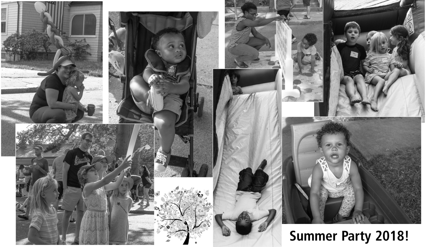
Summer Party 2018!